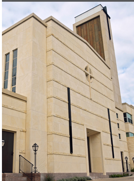
Brazos Masonry Inc. took home the 2019 Golden Trowel Award for restoration of St. Edward's Catholic Church (second photo).